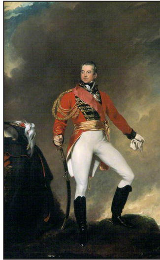
Portrait of George Gordon, 5th Duke of Gordon, founder of the 92nd regiment (Gordon Highlanders), by Thomas Lawrence