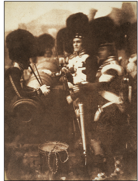
The Gordon Highlanders at Edinburgh Castle