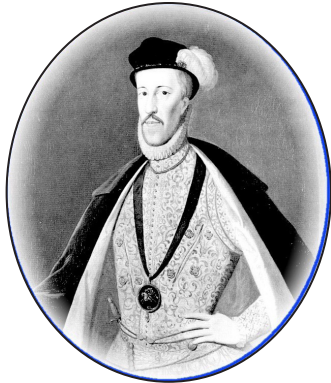
Thomas Howard, 4th Duke of Norfolk