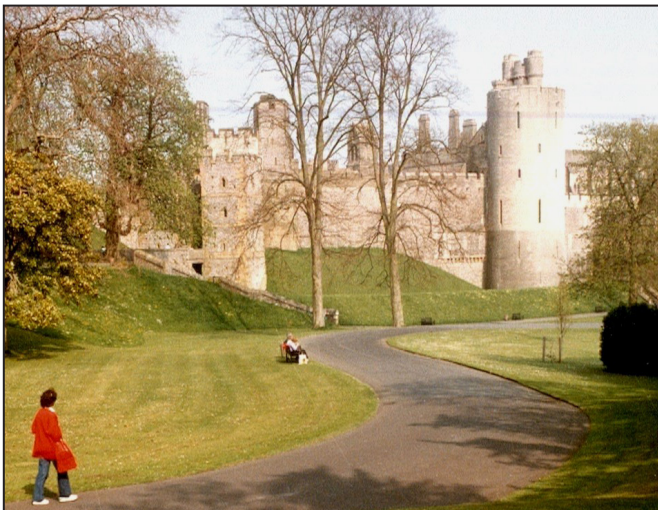
Cecile on grounds of Arundel Castle 1987