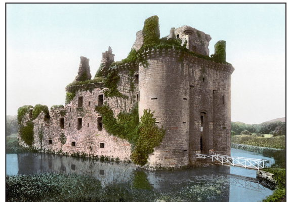
Caerlaverock Castle in Dumfries, Scotland - 1900